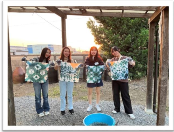
Indigo Dyeing "Aizome" experience in Kawagoe