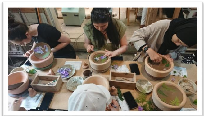
Visiting Tsuruoka Hachimangu (Shirine) and making pottery in Kamakura