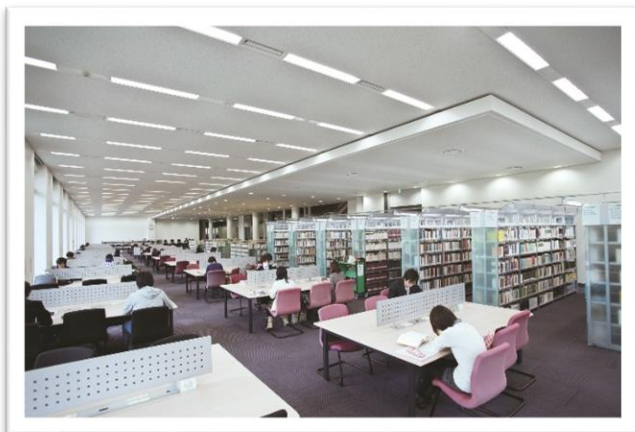
↑ Mandai Memorial Library @ Sagamihara Campus