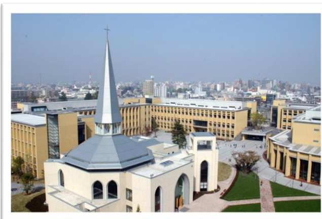
↑ Sagamihara Campus