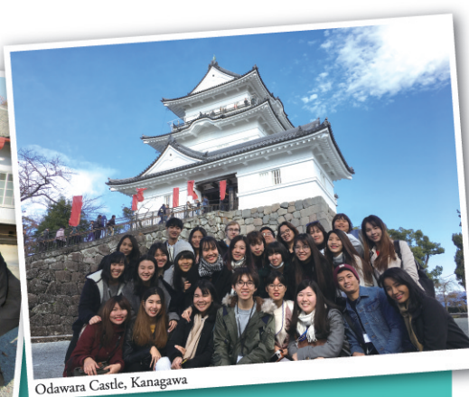
Odawara Castle, Kanagawa