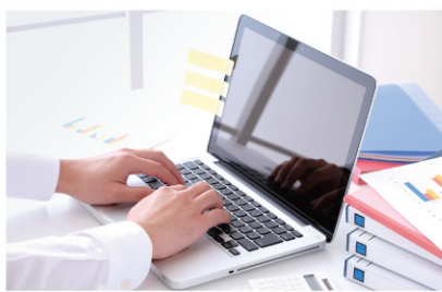
High-speed Wireless Internet