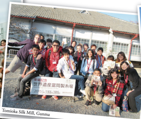
Tomioka Silk Mill, Gunma