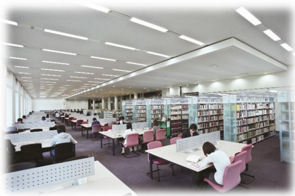
↑ Mandai Memorial Library @ Sagamihara Campus