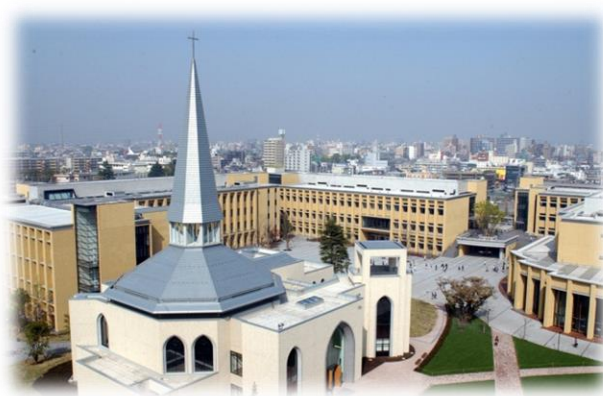
↑ Sagamihara Campus